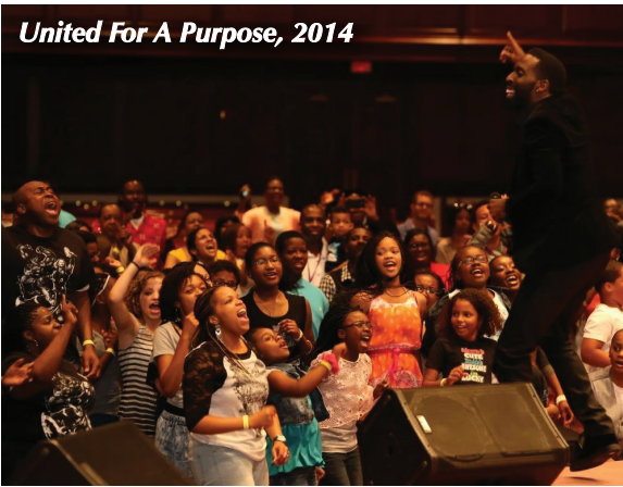
United For A Purpose, 2014